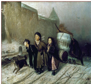
"Troika" Vasily Perov, 1866